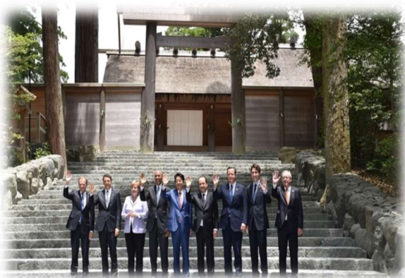
G7 2016 ISE-SHIMA SUMMIT

Local government bodies and organizations outside the EU that cooperate with UIC2 and its governmental member to work toward the practical and sustainable application of drones and flying vehicles while proactively framing and nurturing social acceptance aspects in each region.